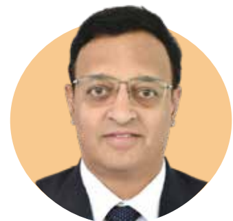
Neeraj Mandloi (IAS) Principal Secretary, UDHD, MP

If we want to become a developed nation by 2047, we need an aggressive economic growth in the next 25 years [...] In that regard development of the cities is essential as 70% of our GDP comes from cities. Therefore, we need to enhance the capability of cities to meet this developmental challenge. We need an aggressively fast economic growth in cities in the next few years [...] we need to invest eight times more in cities than we do today.