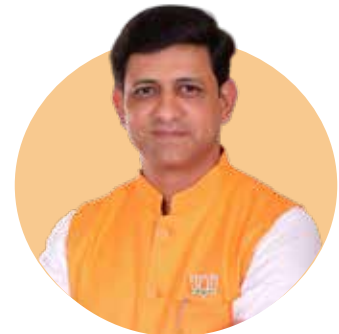
Pushyamitra Bhargav Mayor, Indore

Ahmedabad has always been working towards good governance. This time in Ahmedabad city budget, we have also included the feedback of the citizens. City belongs to all its citizens therefore we will make new budgets based on the suggestion from the people.